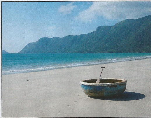
Con Son Island: "blissfully tranquil"

There's only one road, one petrol station and two traffic lights on the main island, Con Son, and the other 15 are uninhabited. The capital is a "pocket-sized" town with "litter-free" streets lined with French-era villas, and a dozen or so hotels and guesthouses. There's also a "no-nonsense" port, Ben Dam, where sailors sell giant durian fruit from the decks of